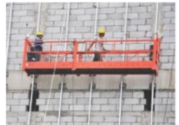
For Wall putty & Texture

We believe in higher safety, faster work & higher productivity.