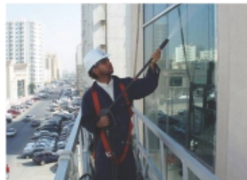
For Glass Cleaning