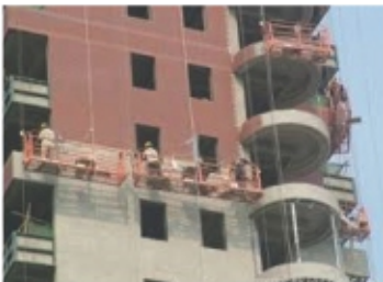
For Painting Work